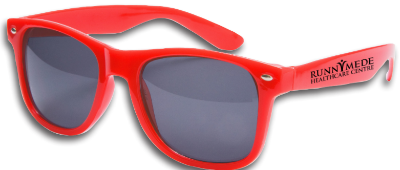
#SG101 "CORONADO COOL" High Gloss Frame Sunglasses