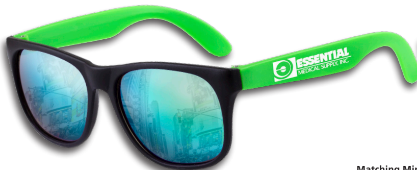
#SG102 "NEWPORT TINT" Colored Mirror Tint Lens Sunglasses with Matte Frame