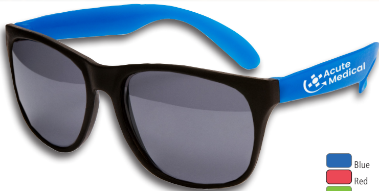
#SG100 "NEWPORT EVERYDAY" Matte Frame Sunglasses