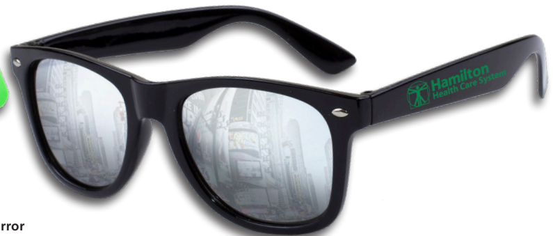
#SG103 "CLAIREMONT" Colored Mirror Tint Lens Sunglasses with High Gloss Frame